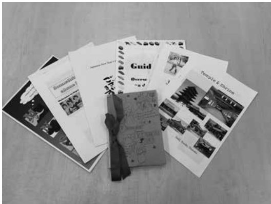
Assorted examples of students' pamphlets introducing Japanese culture

One major realization I had while preparing for the class before the